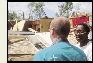
Catholic Charities provides disaster relief services to people in Yazoo County.

The mission of Catholic Charities is to provide help and create hope for those in need. Last year Catholic Charities served over 29,000 children, women and families. For every $1 you give, Catholic Charities provides $9 of service through matching grants.