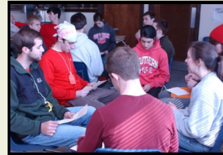
College students gathered at the annual Diocesan Campus Ministry retreat.